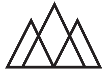
native american symbol for mountains meaning: strength, great abundance