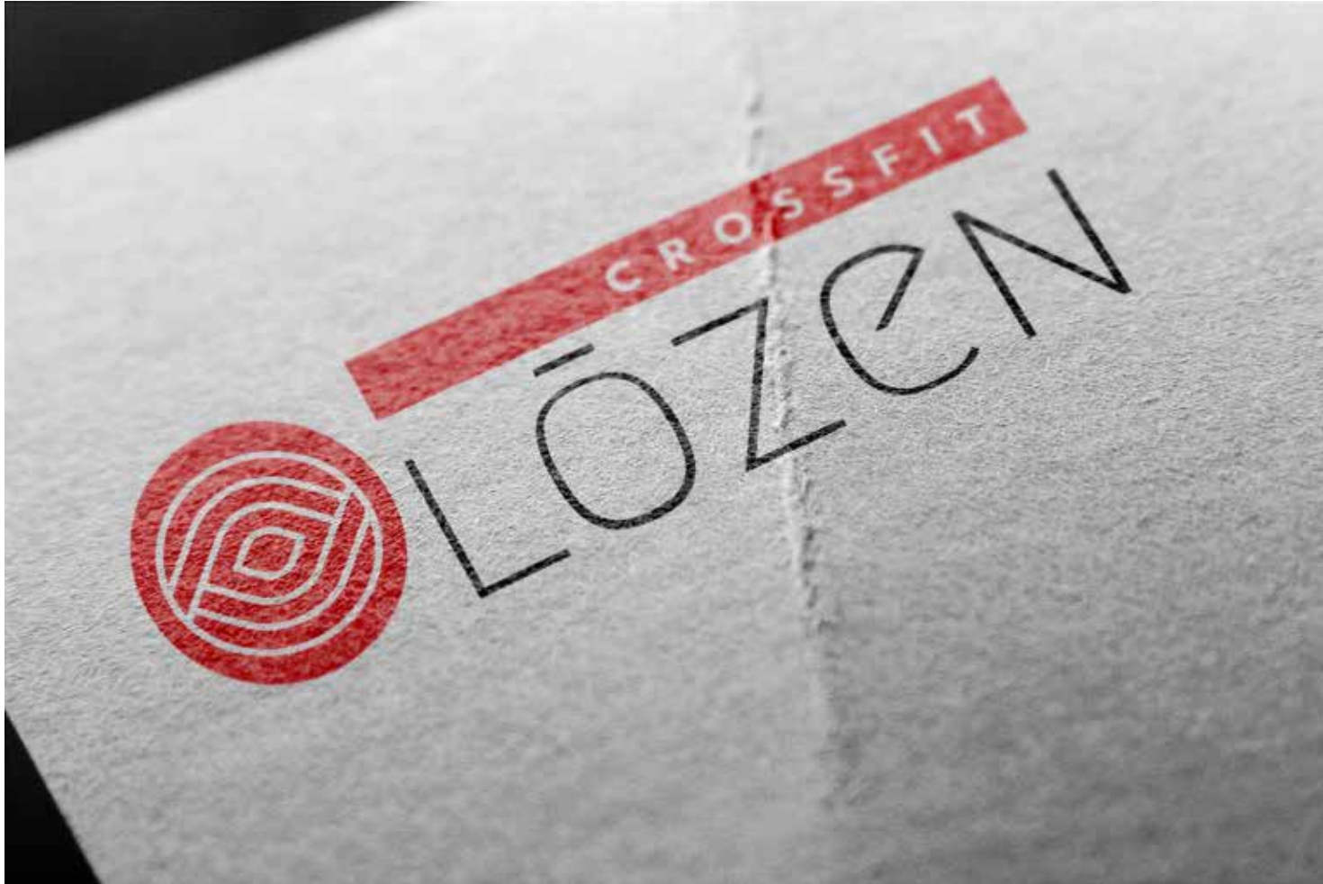
Concept 3: Printed logo mock-up