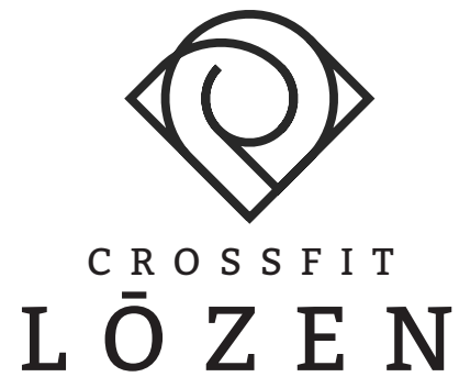
one color logo