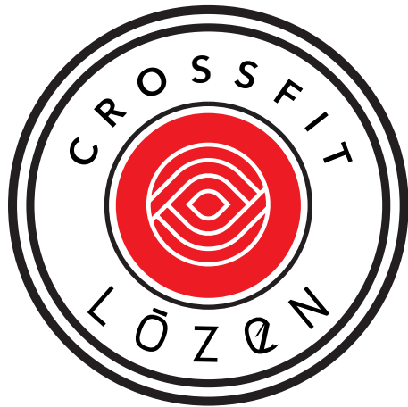
alternate circular logo