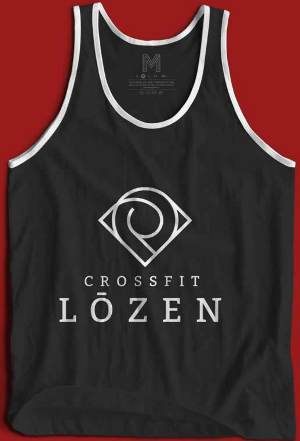
Concept 4: Apparel mock-up