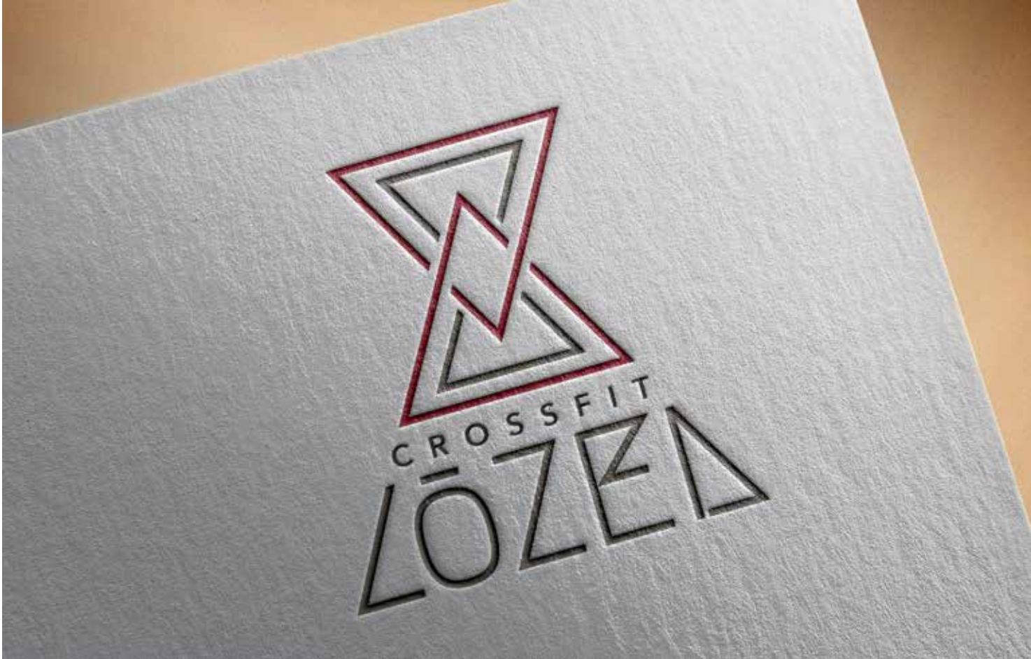
Concept 2: Printed logo mock-up