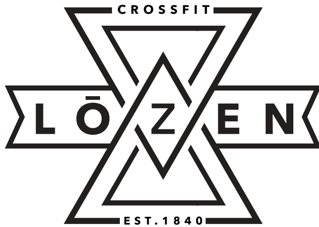
one color logo