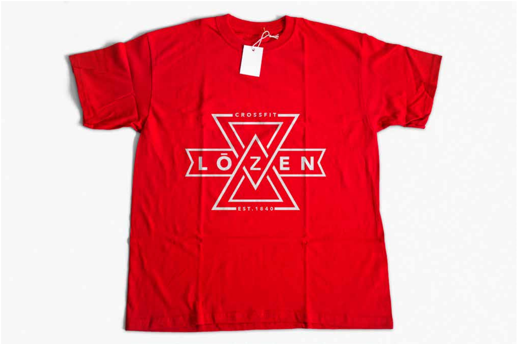
Concept 1 apparel mock-up