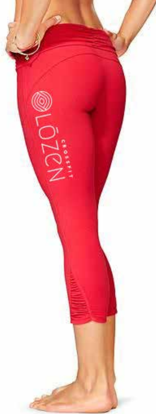
Concept 3: apparel mock-up