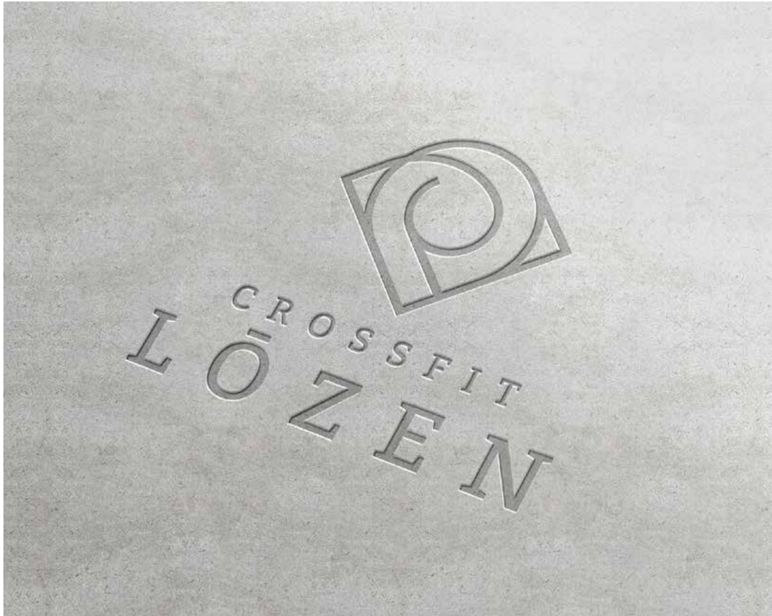
Concept 4: Printed logo mock-up