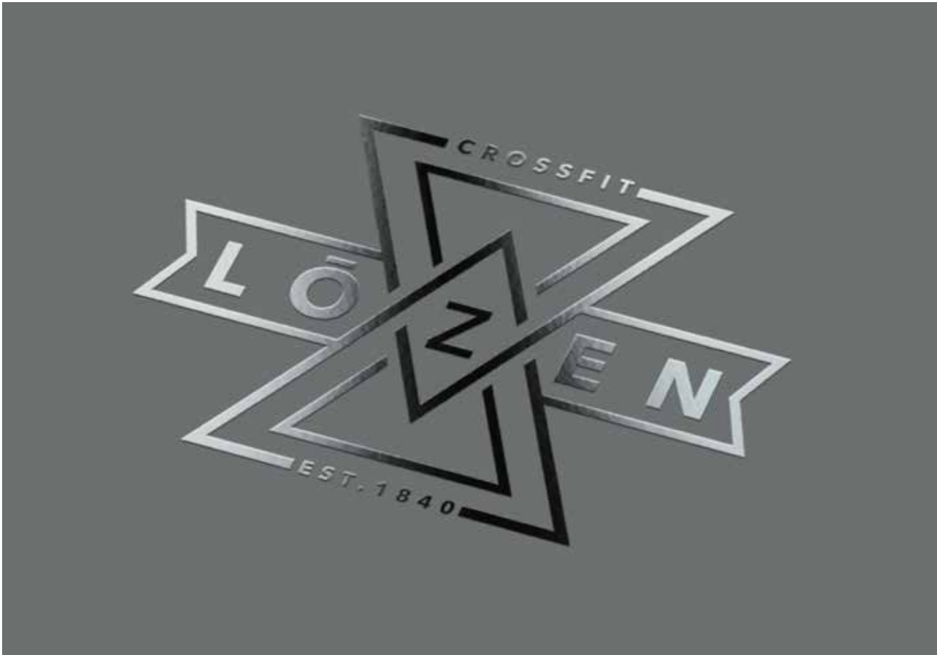
Concept 1 printed logo mock-up