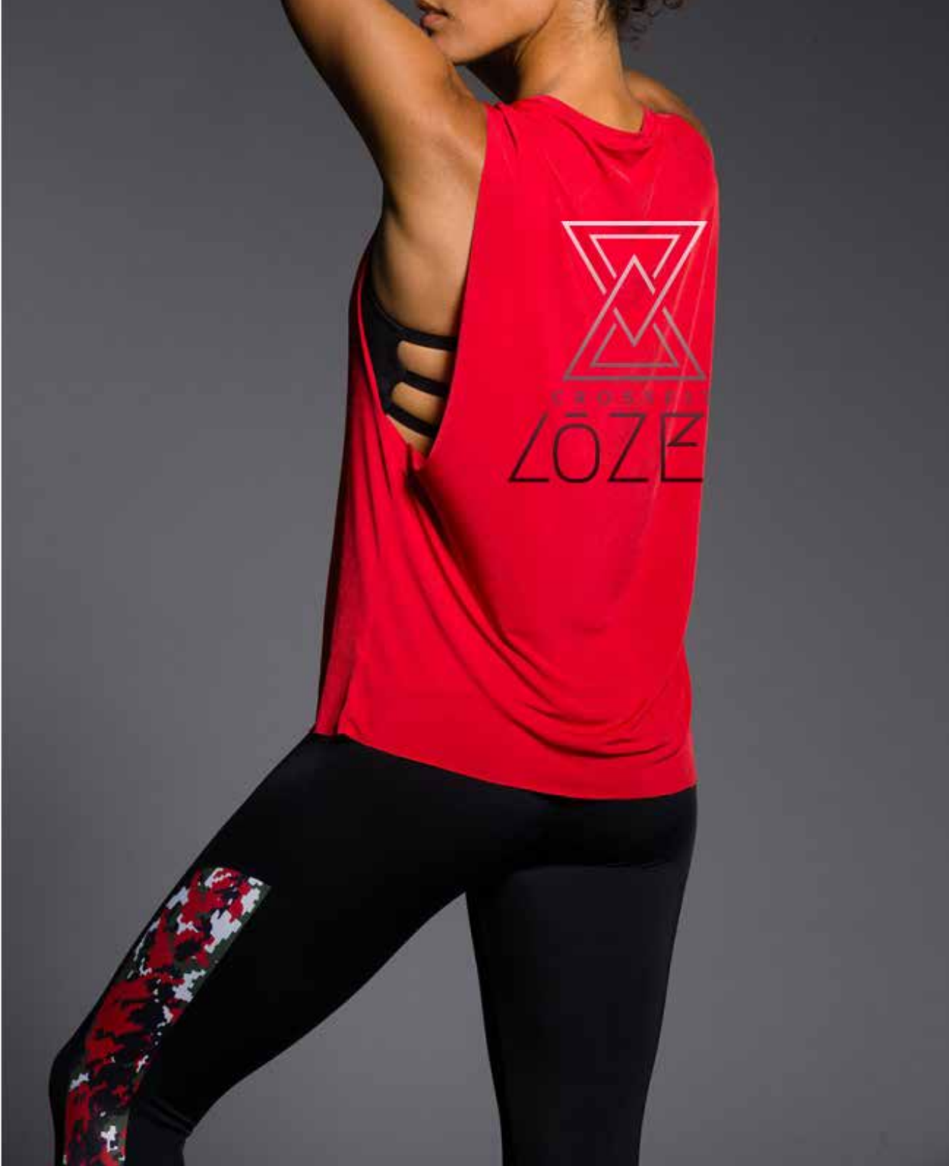
Concept 2: apparel mock-up