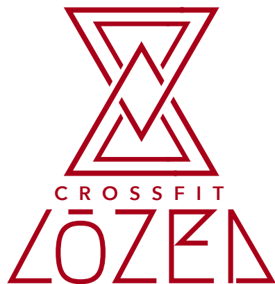
one color logo