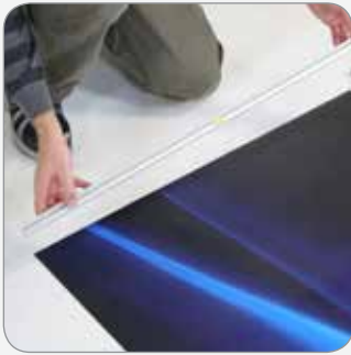
1. Lay top bar out with arrow pointing towards you and away from graphic.