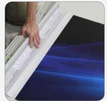
6. Press graphic on firmly. Remove pin on side of base and slowly let the graphic slide into base.