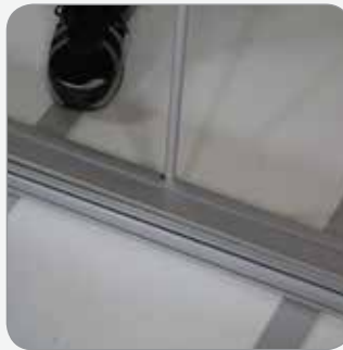
8. Insert pole into base.