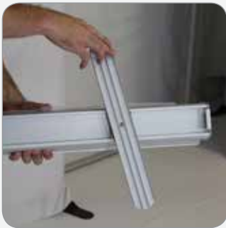
7. Slide feet out from base.