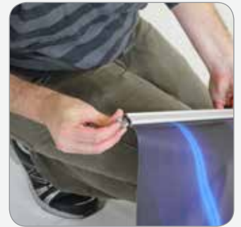
3. Close top bar by inserting end pieces.