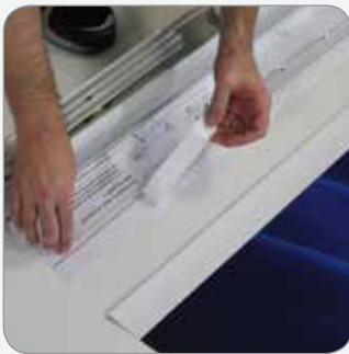
4. Remove tape cover from base.