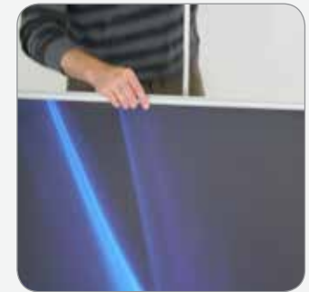
9. Slide graphic up. Latch onto top of pole and reinsert pin into base to secure graphic.